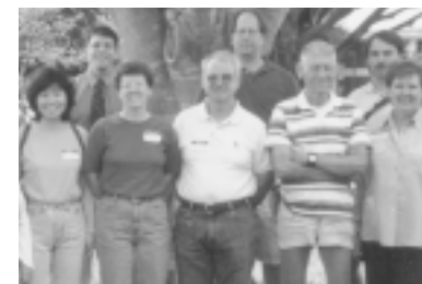
The Broward County Bike Action 2000 group.

Bicyclists are already a common sight in downtown Key West. Bicycle parking, however, is not.