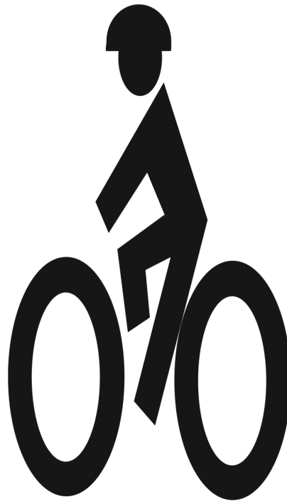
Bicycle lane symbol marking

A cyclist operating on a one-way street with two or more marked traffic lanes may ride as close to the left-hand edge of the roadway as practicable.